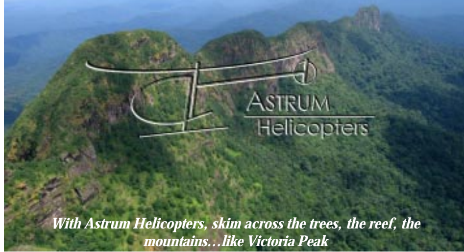
With Astrum Helicopters, skim across the trees, the reef, the mountains...like Victoria Peak