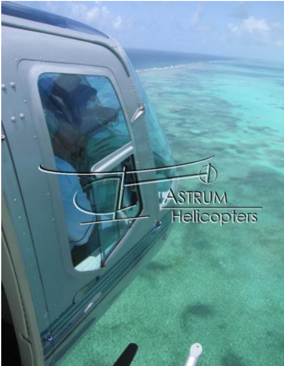
Take in the amazing views as the pilot makes the helicopter climb gracefully to over 500 feet and accelerates to over 120 miles per hour.