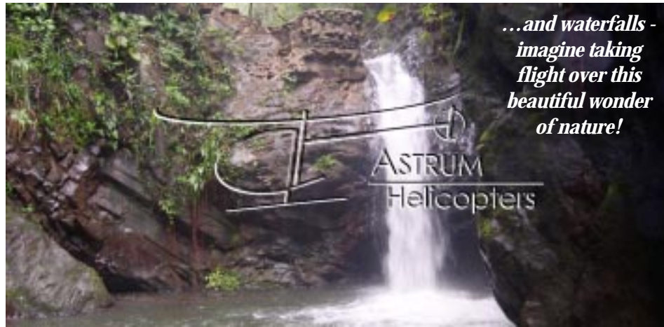
...and waterfalls - imagine taking flight over this beautiful wonder of nature!