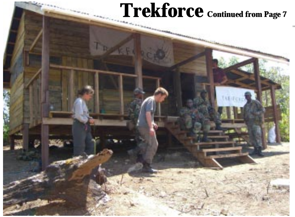
The Rio Blanco observation post will enable the BDF to have a permanent presence in Chiquibul National Park.

ervations, contact the fine folks at Astrum at 222-5100 or visit their website at www.astrumhelicopters.com