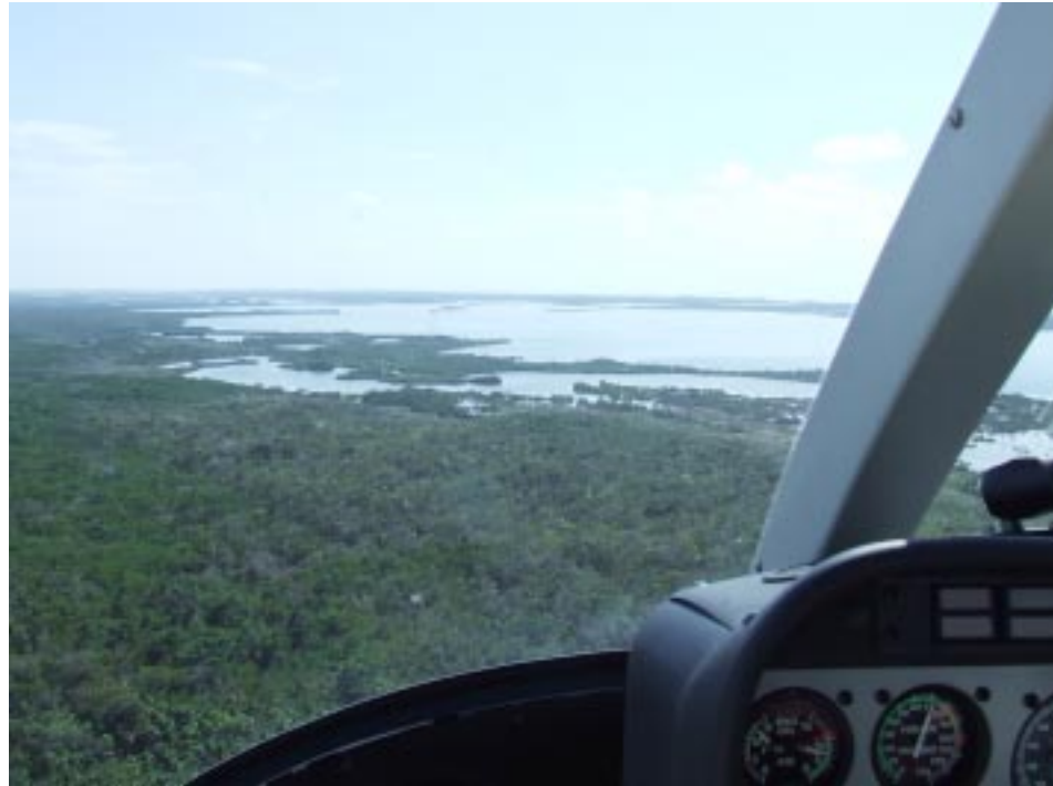
Experience one of the most beautiful stretches of pristine coastline in Belize plus sightings of the Caribbean Sea's most spectacular marine creatures.

and back, it is all organized for you and your family to take pleasure in. These private helicopter charters are the most memorable means of travel and the most efficient. Not only is your travel time much reduced but it's all so exciting! And what better way to arrive than in grand style.